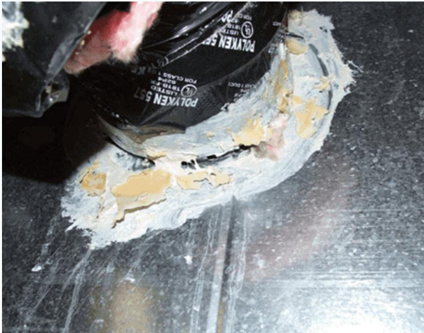
Joint and seams thoroughly sealed